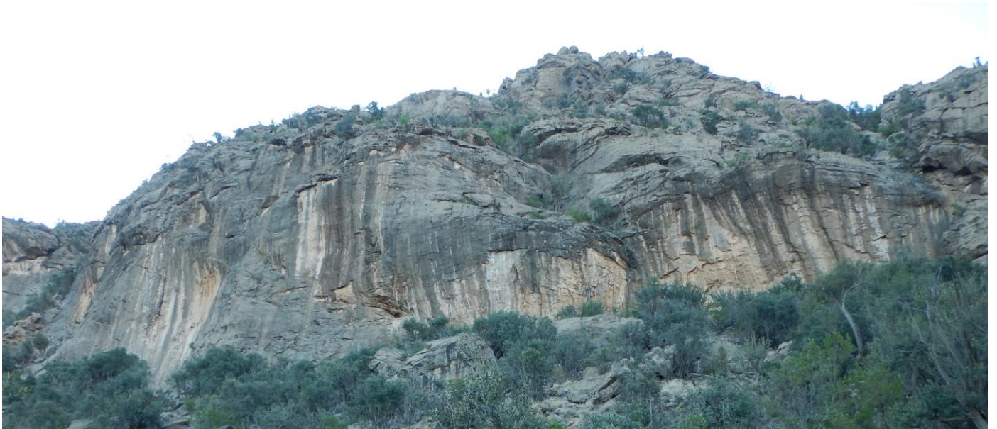
The super steep sector (home of the tufas)