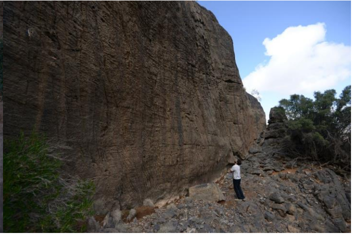
Steep and crimpy