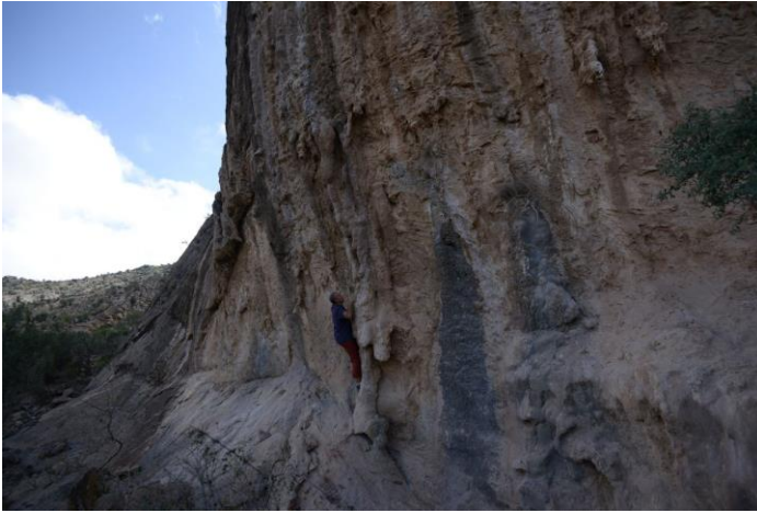
Some amazing tufas