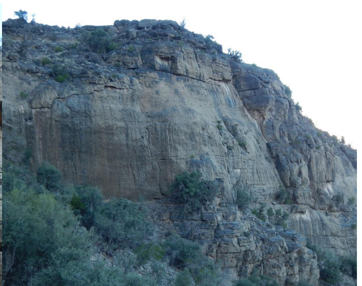
Steep and/or slaby