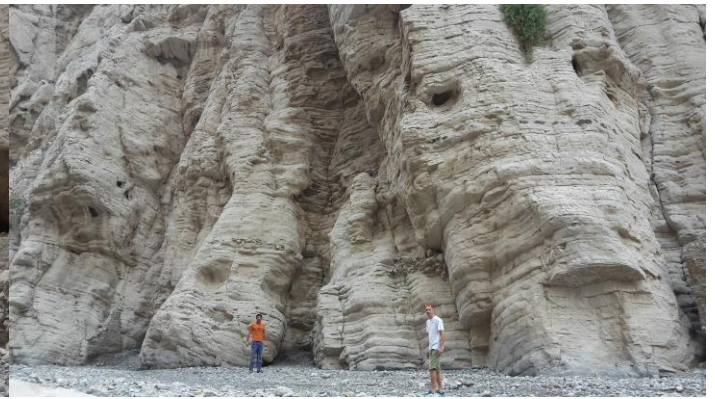
A bit steeper