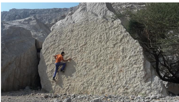
Bouldering in a wadi nearby...