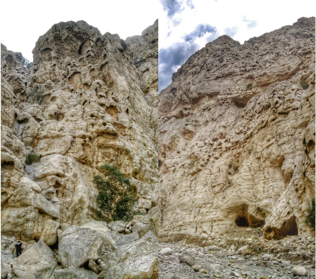
The huge walls