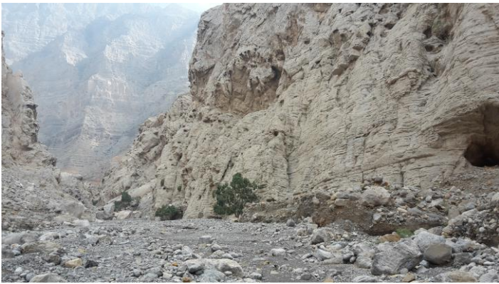
Base of the slabs